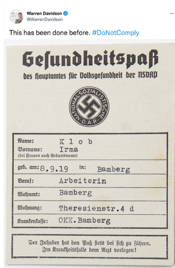
Ohio Congressman Warren Davidson shared a Nazi-era vaccination card to his Twitter page on January 12, 2022.

In January 2022, Ohio Congressman Warren Davidson compared COVID-19 vaccine mandates with Jewish suffering under the Nazis, tweeting , “This has been done before,” posting a Nazi-era health pass alongside the message #DoNotComply. 8