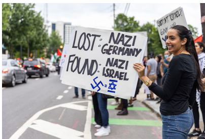
An activist holds a sign equating Nazi Germany with the State of Israel, May 2021

In May 2021, during the most recent conflict between Israel and Hamas, anti-Israel protesters across the country and around the world used language to describe Israel that crossed the line from criticism to anti-Jewish hatred. At one such protest in Atlanta, Georgia, a protester held a sign reading, “Lost: Nazi Germany. Found: Nazi Israel” with a Nazi swastika equated with a Jewish Star of David.